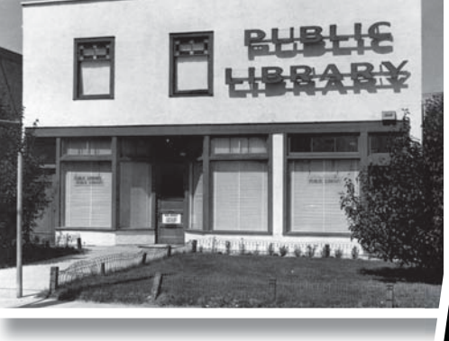
From 1955 to 1973, the Phoenix Starter Alternator Repair building was home to the Saskatoon Public Library.

hoenix Starter Alternator Repair has been serving the residents of Saskatoon and surrounding area for almost 20 years. Located at 1002 20<sup>th</sup> Street West, the company supplies and repairs a broad range of starters and alternators.